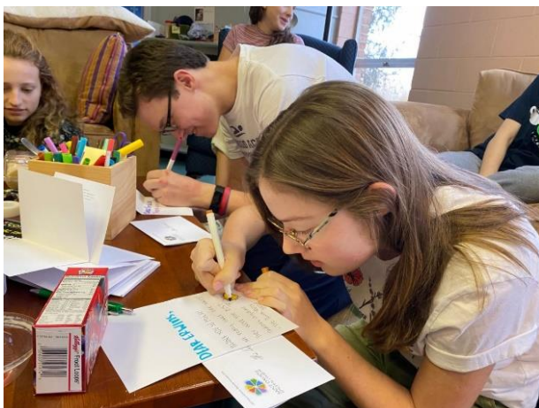
Writing Thank You notes to folks who were wonderful enough to fix EYC dinners.