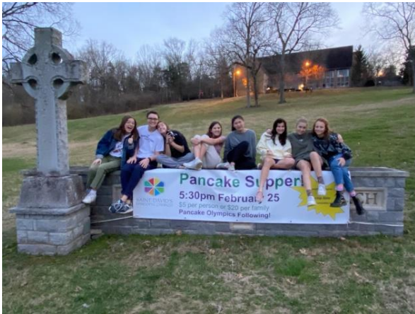
Goofing off after setting up the Shrove Tuesday banner.