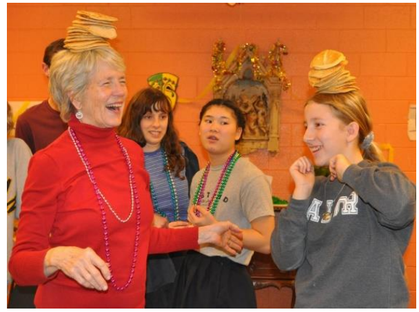
Providing excuses to be silly, smile broadly and laugh at ourselves!