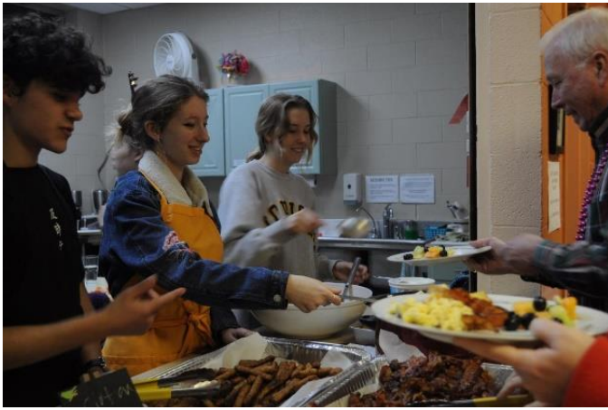
Serving up goodness and love at the 2020 Pancake Supper.