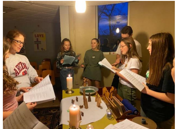
Spontaneous "Children's Church" after hanging the banner!