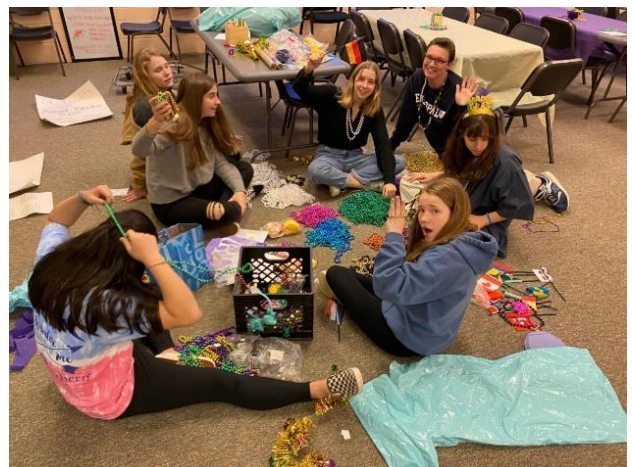
Organizing beads and decorations for Shrove Tuesday's Pancake Supper.